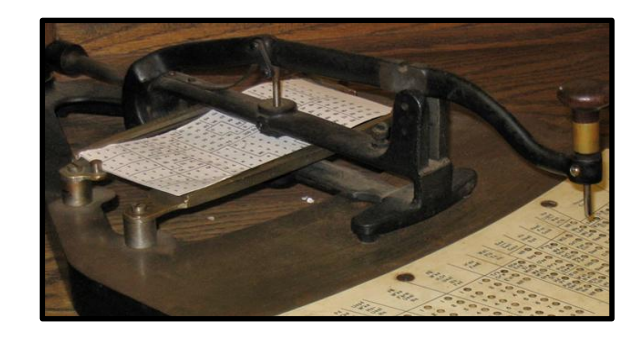
Hollerith Card Punch at the Hursley Museum

Hollerith was a mechanical engineer who lectured at the Massachusetts Institute of technology (MIT). He had a special interest in the use of punched cards as a means of automating mechanical tasks along the lines of the cardboard punched cards used to guide steamdriven looms and pianolas (a self-playing piano).